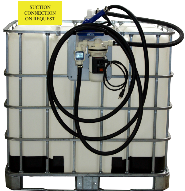
TIM-DEF-3 (tote not included)