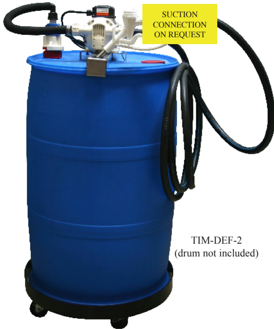
TIM-DEF-2 (drum not included)